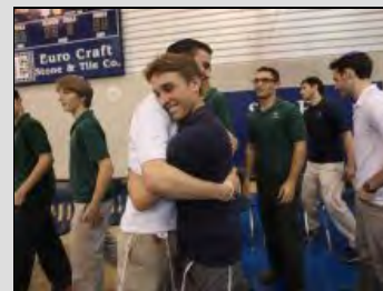
Jewish school's basketball team wins at hardball