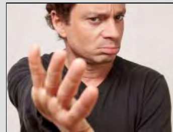
SNL alum Kattan makes S.A. debut