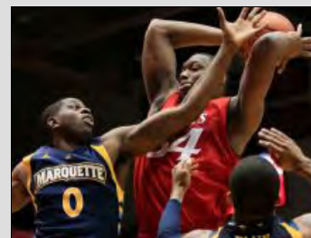
No. 8 Marquette, No. 11 Georgetown play for 2nd